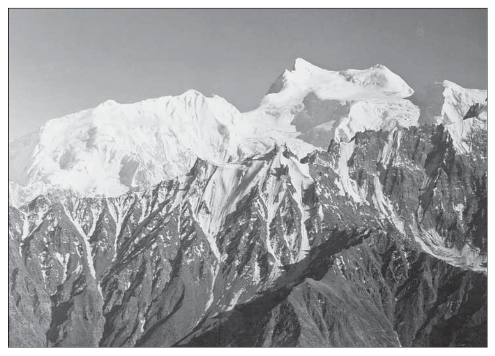
Photo 2 High-mountain relief with conspicuous morphostructural features in the contiguous zone of the Great Karakoram Range with Malubiting Massif (7,458 m) of the northwestern Himalaya. In the background (left), the Yengutz Har Peak (7,027 m) is built of Paleogene sandstones, limestones and quartzites. Alpine-type crests above the Hispar valley are formed on the Upper Paleozoic gneisses, micaschists and marbles.

sion zone of the Indian and Asian plates (Searle 1991, Zanchi, Gritti 1996, Searle et al. 1999 and others) where orogenic movements are still very active. The challenge of searching for landform development as the geomorphological record of active orogeny (Kalvoda 1988, 1992, Owen 1989a, b, Fielding 1996) is in the western Karakoram traditionally integrated with the investigation of recent climate-morphogenetic changes of relief and landscape patterns (Paffen et al. 1956, Schneider 1959, Wiche 1959, Goudie et al. 1984a, b, Li-Jijun et al. 1984, Finsterwalder 1996). The nature of the Hispar Mustagh Karakoram has been studied to more than a century (e.g. Rabor 1904, 1905, Oestrich 1906, comp. Miller 1984, Finsterwalder 1989). The first observations of glaciers (Workman, Workman 1910, Dainelli 1922, 1934a, b, Norin 1925, Visser 1928, Mason 1929, 1930, 1935) indicated the extraordinary features of natural hazards in the Karakoram (Desio 1954, Hewitt 1961, 1964, 1968, 1969, 1984, 1988, Belousov et al. 1980, Brunsden, Jones 1984, Kurshid et al. 1984, Gardner, Hewitt 1990, Shen-Yongping 1991, Kuhle et al. 1998, Derbyshire et al. 2001). The other topics of research in the western Karakoram have been the dynamics of glaciers (e.g. Pillewitzer 1957, Zhang Xiansong 1980, Zhang Xiansong, Shi Yafeng 1980, Derbyshire 1984, Dong Bin et al. 1984, Goudie et al. 1984b, Oswald 1984,