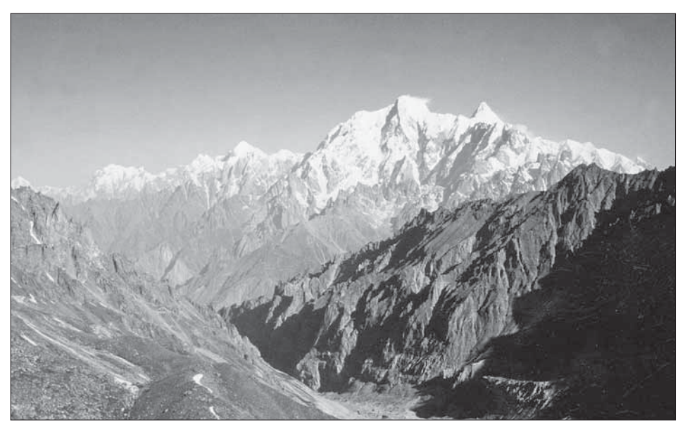
Photo 1 Conspicuous vertical climate-driven morphogenetic zoning of the high-mountain relief in the Hispar Mustagh and Hunza Karakoram originated on different lithological and morphostructural units. Rocky slopes above the lower part of the Gharesa glacier (3,800–4,000 m a.s.l.) display a system of slope and periglacial sediments. In the background, the canyon-like Hunza valley (2,000–2,200 m) appears under eastern face of the Batura Massif (7,980 m).

Landforms in the Himalaya and the Karakoram provide evidence for the nature of very dynamic landscape evolution. The Himalaya and the Karakoram are in the colli-