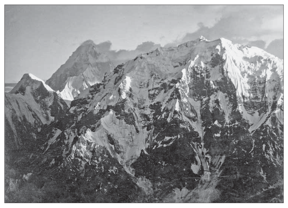
Photo 3 Extremely dissected rock relief of the Chogo Lungma ridge (7,000 m) in the Hispar Mustagh Karakoram was developed by the integration of orogenetic uplifts with rapid climate-morphogenetic processes in the Late Cenozoic. Glaciated ridges consist mainly of crystalline limestones and dolomites, gneisses and amphibolites of Mesozoic age, large lower slopes are formed on limestones, marbles and gneisses.

glacier tongue and southwards of the village of Nagar. Morphostructural conditions between the Malubiting and the Chogo Lungma Massif (Photo 3) are very complicated toward the E. Their summit part and practically the whole Haramosh Massif lying farther to the S are already constituted of migmatite, granite and gneiss bodies so that Chalt Formation rocks are preserved only in a narrow (ca 10 km wide) zone between the Minapin Peak and the Chogo Lungma glaciers' collecting area.